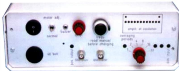
Back panel of the MicroTweezer Control Box.